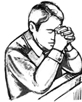
Oh, that I knew where I might find him, that I might come even to his dwelling! Job 23:3, NRSV

1 Job answered [his friend:] 2 “Today also my complaint is bitter; [God’s] hand is heavy despite my groaning. 3 Oh, that I knew where I might find him, that I might come even to his dwelling! 4 I would lay my case before him, and fill my mouth with arguments. 5 I would learn what he would answer me, and understand what he would say to me. 6 Would he contend with me in the greatness of his power? No; but he would give heed to me. 7 There an upright person could reason with him, and I should be acquitted forever by my judge. 8 “If I go forward, he is not there; or backward, I cannot perceive him; 9 on the left he hides, and I cannot behold him; I turn to the right, but I cannot see him. 16 God has made my heart faint; the Almighty has terrified me; 17 If only I could vanish in darkness, and thick darkness would cover my face!”